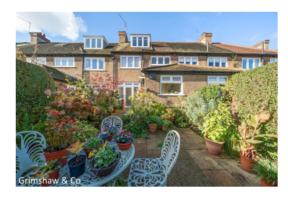
EPC Rating = D Council tax band = G (subject to confirmation)