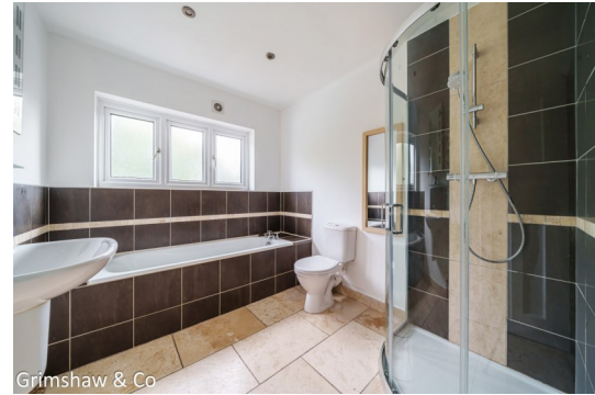
Grimshaw & Co