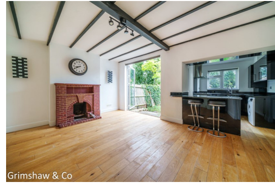
Grimshaw & Co