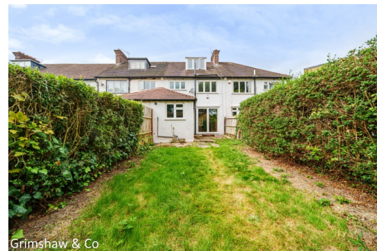
Grimshaw & Co

EPC Rating = D Council tax band = G (subject to confirmation)