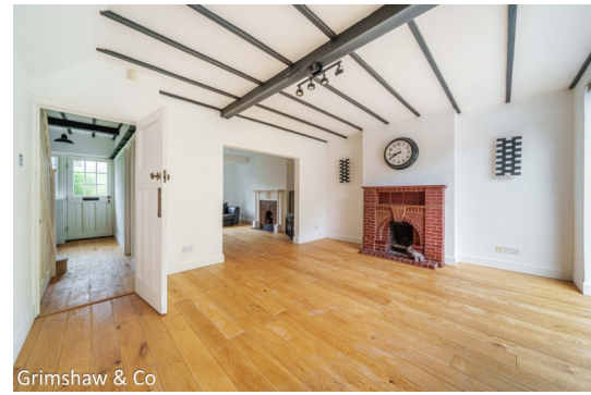
Grimshaw & Co